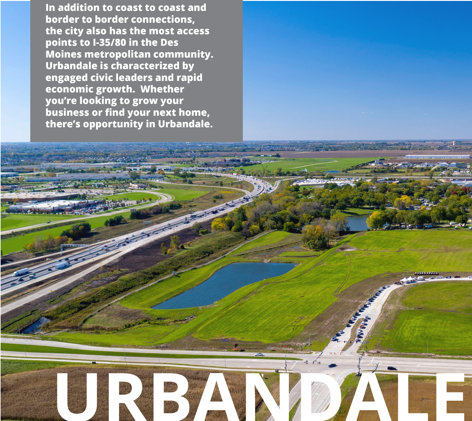
100th Street Interchange in Urban Loop

In addition to coast to coast and border to border connections, the city also has the most access points to I-35/80 in the Des Moines metropolitan community. Urbandale is characterized by engaged civic leaders and rapid economic growth. Whether you're looking to grow your business or find your next home, there's opportunity in Urbandale.