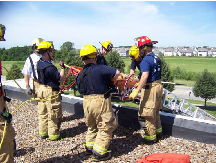
Training on removing a customer from the roof using ladders...