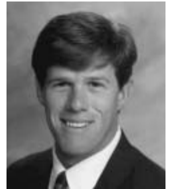
Brad Zaun, Mayor

I urge you to stay informed as well. Read the newspaper. Visit the legislature's web site ( http://www.legis.state.ia.us/ ) and learn about the issues. When you feel strongly about an issue, contact your legislators. And, as always, please do not hesitate to contact the City Council or me to share your thoughts. By working together, state and local officials and citizens can ensure the best possible outcome for all Iowans.